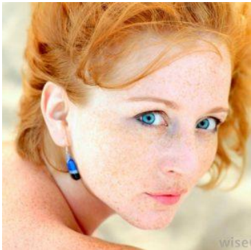
Irish Albino (left) ancient generation Irish albinos (middel, right)