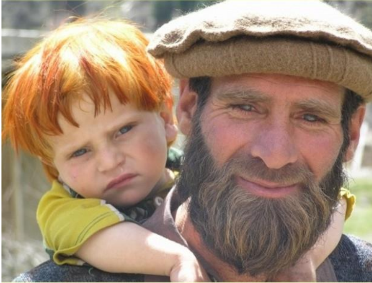
Nuristani father and son: The Nuristani are an original Albino people of the Hindu Kush mountain region of Eastern Afghanistan and the Chitral area of Pakistan.