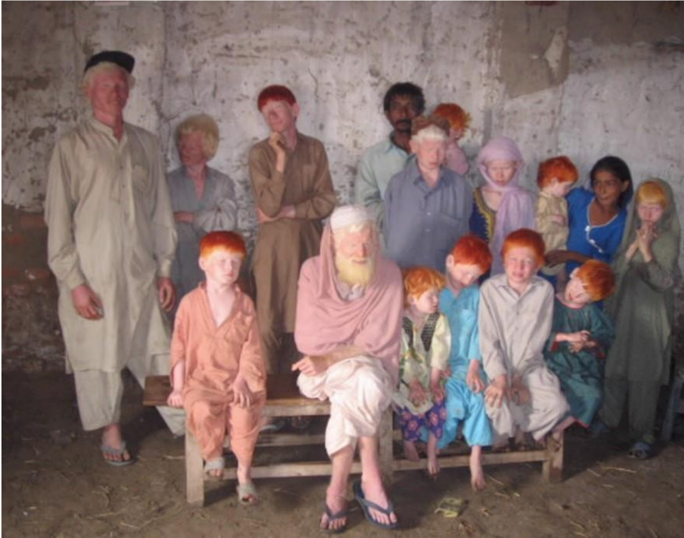
Bathi albinos from Pakistan with their dark colored parents.