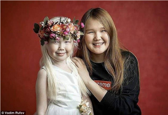
Top model Russian albino (left)