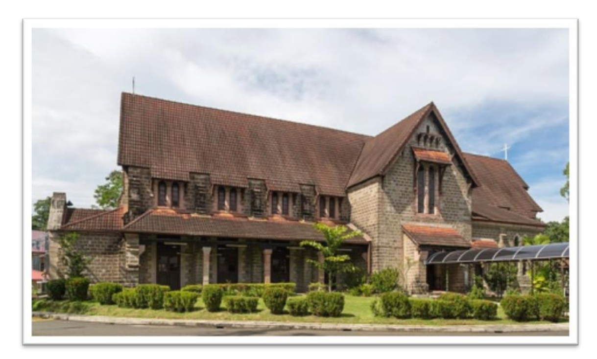
Malaysia : The Parish of St Michael and All Angels – Sandakan; Sabah;