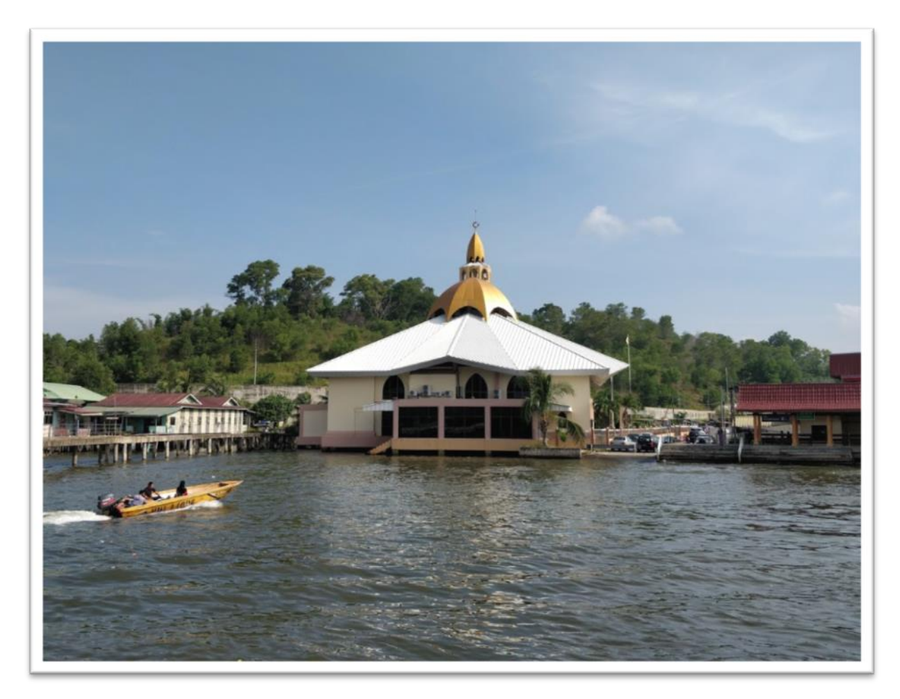
Brunei : Al-Muhtadee Billah moskee - kampong Ayer