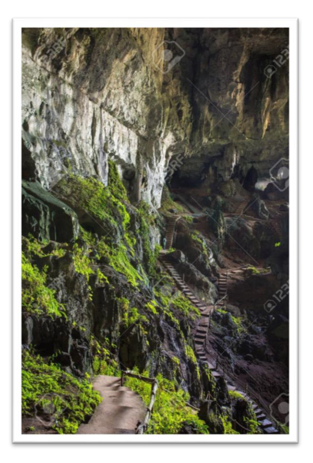
Malaysia : Caves Gua Pari Pari – Sarawak;