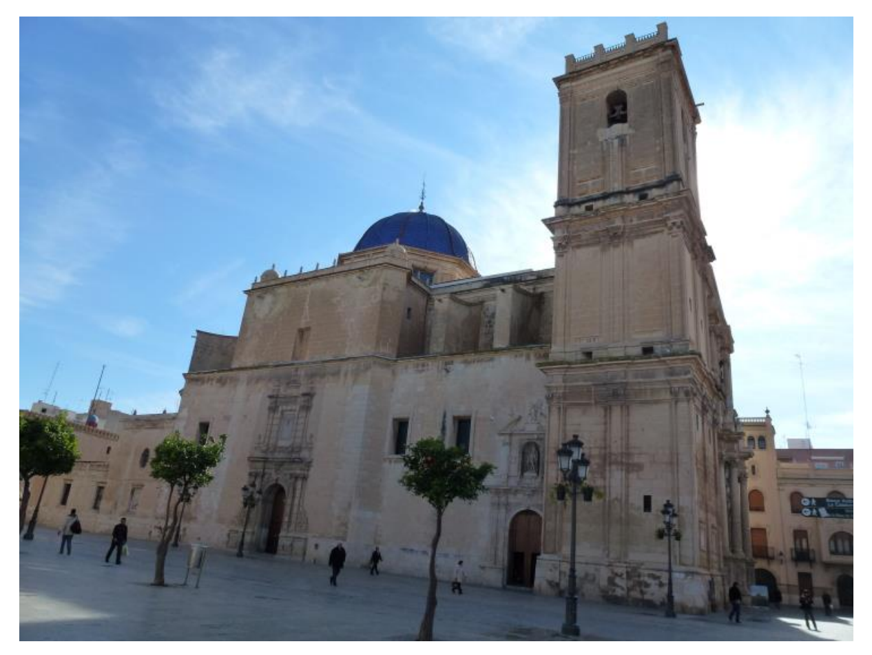
Basilica de Santa Maria.