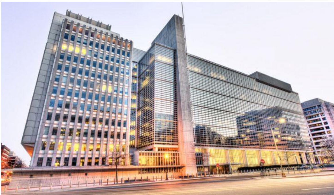
Building World Bank

Meeting in front of the World Bank building.