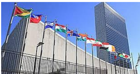
Headquarter of the United Nations