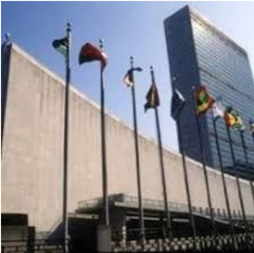
Headquarters of the United Nations

USA – New York : The Headquarters of the United Nations