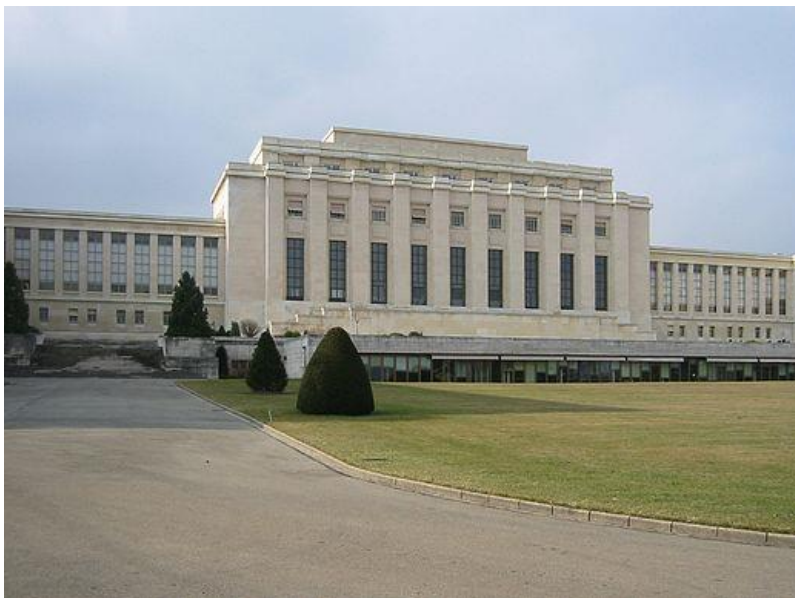
Palais des Nations Genève

Meeting in front of the Palais des Nations