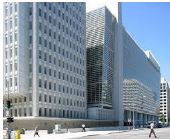
Building World Bank

The World Bank is the world's largest institute for development cooperation. It provides loans to developing countries and middle-income countries with the main objective of combating poverty. The international bank is technically a specialized organization of the United Nations.