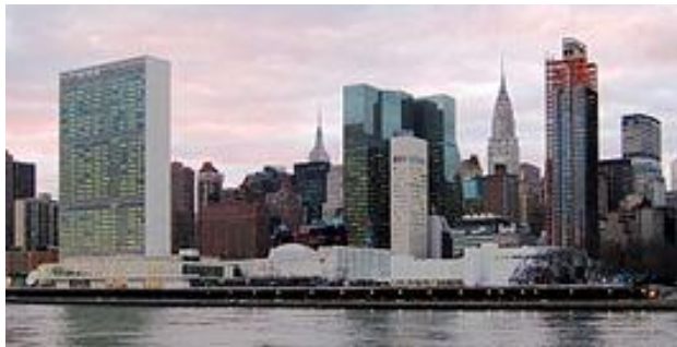
United Nations Headquarter in New York