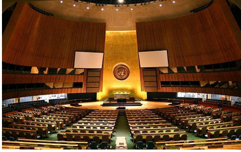
Meeting room of the United Nations

The General Assembly of the United Nations consists of all member states of the United Nations. The meeting meets in an annual session. This annual session normally starts on the third Tuesday of September and lasts until mid-December. Additional meetings can be requested by the United Nations Security Council or by a majority of UN members. The General Assembly is the only UN body where all members meet. During the meeting, initiatives can be launched on issues such as peace, economic progress and human rights.