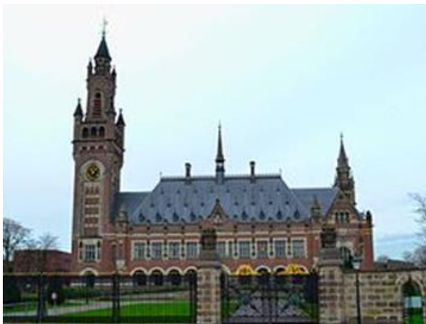
The Peace Palace in The Hague