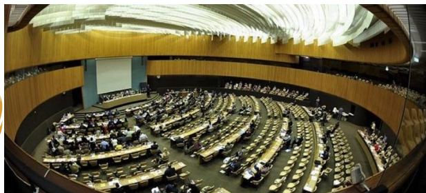
Logo + Meeting room United Nations Economic and Social Council