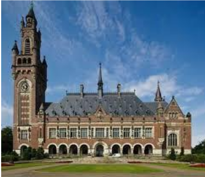
The Peace Palace in the Hague

The Netherlands – The Hague : International Court of Justice.