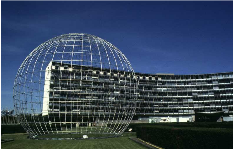
Unesco House Paris.

Meeting at the globe in front of the UNESCO HOUSE.