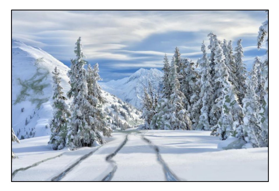
Suddenly, drops of water fell into the freezing environment. There was a movement of small streams of water. Movement is LIFE.

Suddenly, I heard the sound of falling water drops. The drops became very small streams of water. Nature was in motion. There was movement in the thick layer of snow, movement of running water.