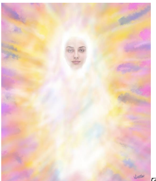
radiance of our soul.

A morontia personality who sees the radiance of our soul will recognize these colors. See the following drawing :