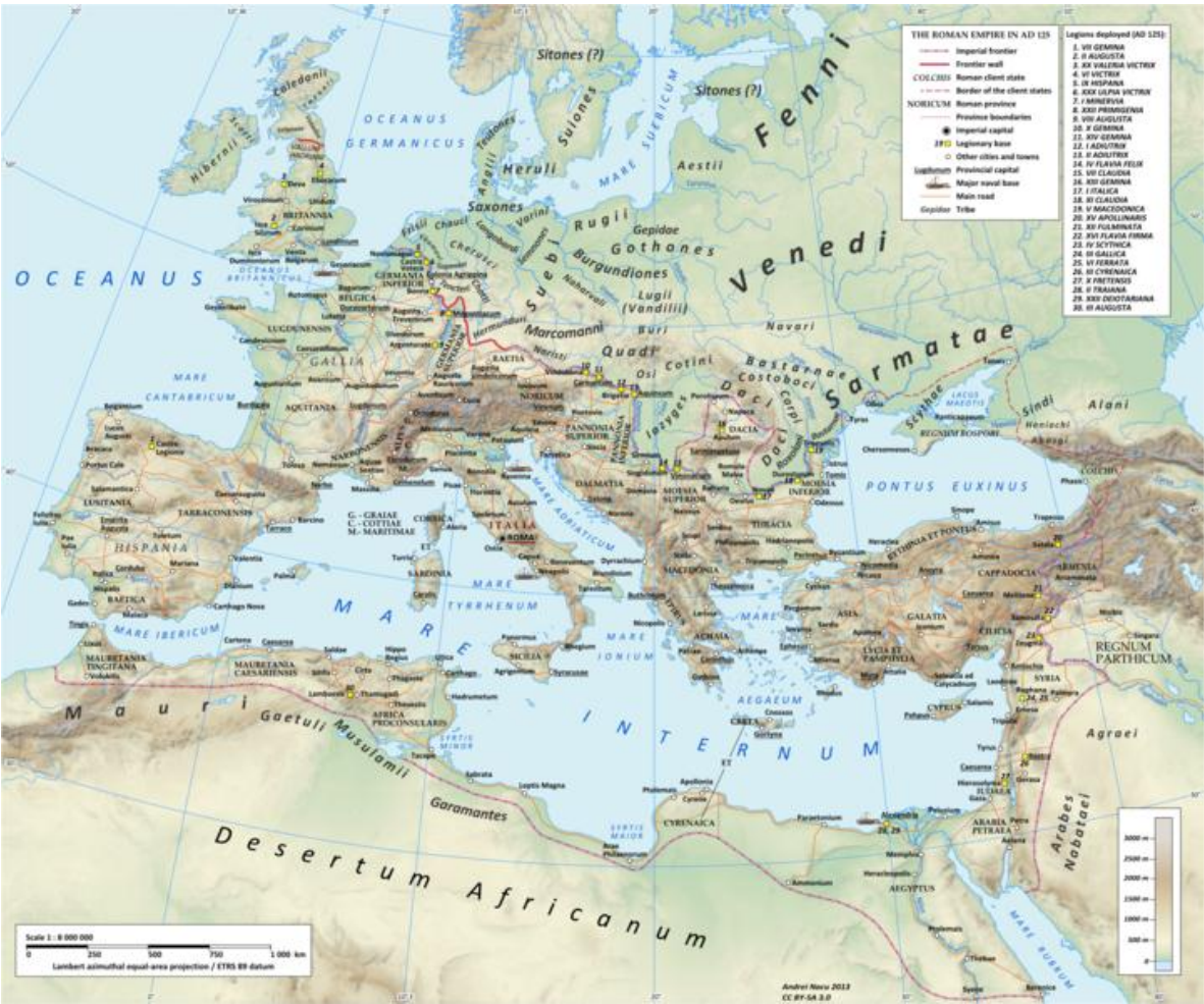
Roman map with their occupied territories.