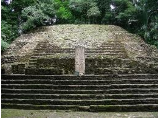
Lamanai: the little temple with the Stella n° 9 which was dedicated to a person who had a connection with a High Ruler of Earth Quarters between 650 A.D. and .....

There were dynasties among the Maya's with great kings and high priests that were very capable and to whom we were able to communicate and transmit our knowledge.