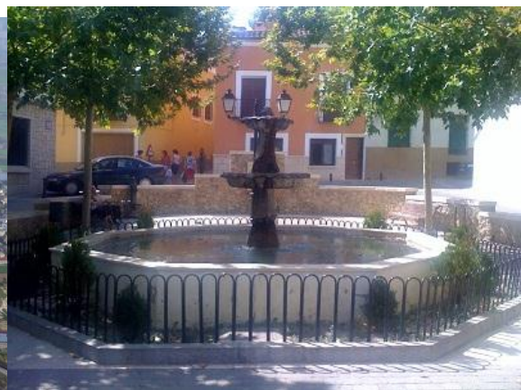
center city Huete.