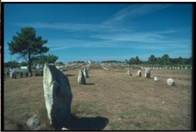
Giant Menhir Light Anchor