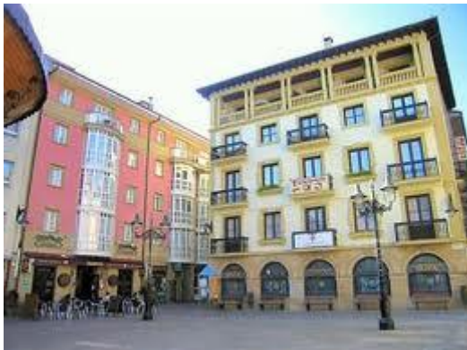
Hotel in Zarautz

Suddenly two people came to us asking what we were looking for and as it was so late we asked them where there were hotels near the sea. They told us to continue to Zarautz only 10 min drive from there - just a little further, as by coincidence. We ended up finding a hotel for 5 persons in Zarautz around a square with a kiosk and it was only the next day that I saw the large sign on a house around that square: "You are in the Basque country, this is neither Spain nor France" with their political office on the first floor. The celestials succeeded in having us exactly where we had to be... incredible but true.