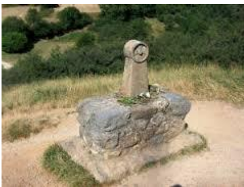
Little monument with Light Anchor