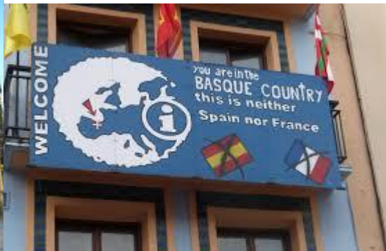
Office of Basque separatisme.