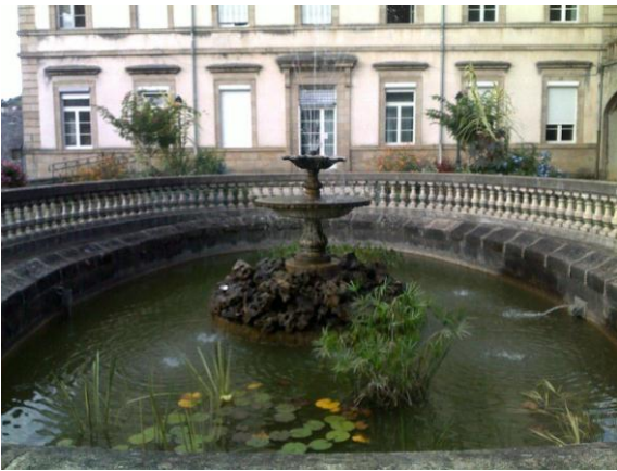
Tulle retrieving data.