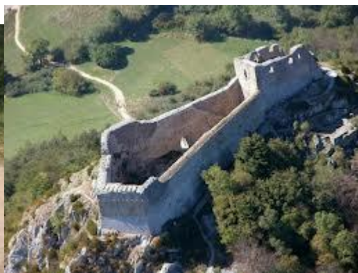
Castle of Montsegur.

You will go where there is a small monument which commemorates the stake where 250 Cathars were burned alive. Many people have been