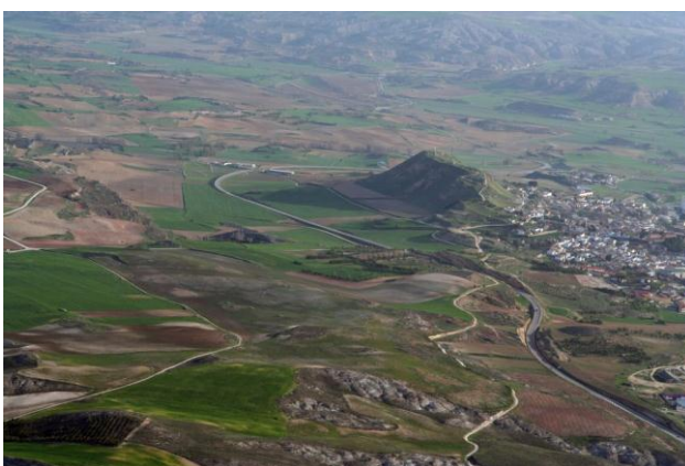
Data retrieving almost on top mountain

You can also create an anchor on the central square of the city and use it like the other ones.